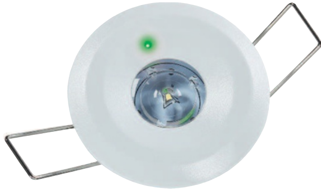
LDE3F/WIDE/WH White Downlight

When the normal mains supply fails the LDCK330/40 powers the LDE3F downlight for 3 hours. The LDCK330/40 has Class II insulation, an Extra Low Voltage output and features double insulated wires to the downlight to provide additional mechanical protection.