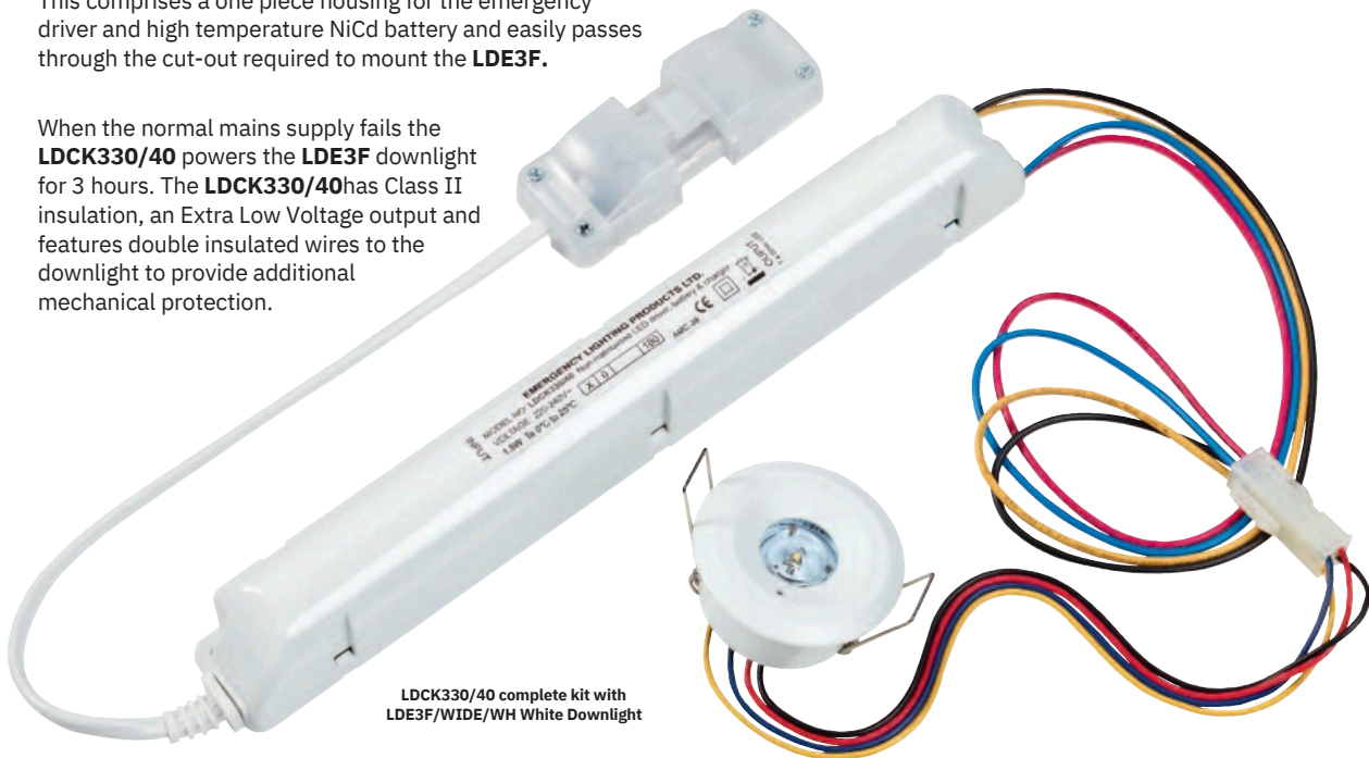
LDCK330/40 complete kit with LDE3F/WIDE/WH White Downlight