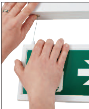
Simple height adjustment