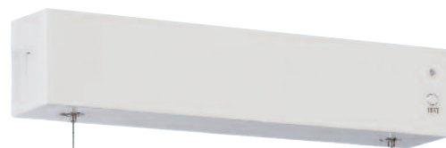
Adjustable suspension wire Length: 15mm to 1metre