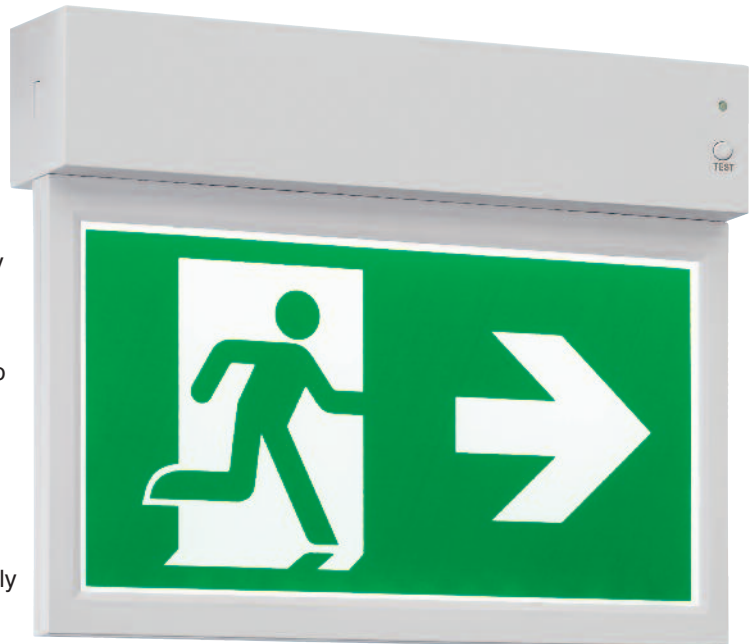
MXL/ESA08 and MXL/ESA10