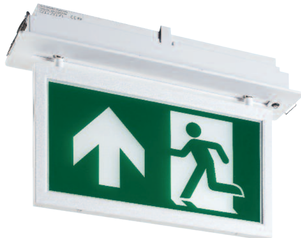
MXL/ESA11/M3/RB (using /RB recessing accessory)

MexLITE Exit Signs can be supplied with a ceiling recessing accessory allowing the standard body to recess into a ceiling cut-out mounting bracket. This feature is ideal for applications requiring a more aesthetic installation.