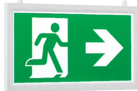
MXL/ESA09 and MXL/ESA11