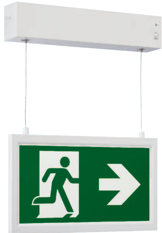
MXL/ESA09/M3 (small) MXL/ESA11/M3 (large)