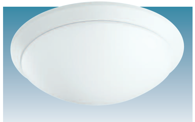
XL400/230 Standard base